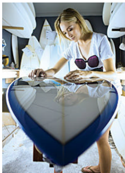
Bird Rock Surf